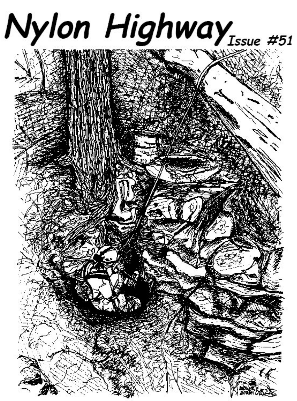
... especially for the Vertical Caver